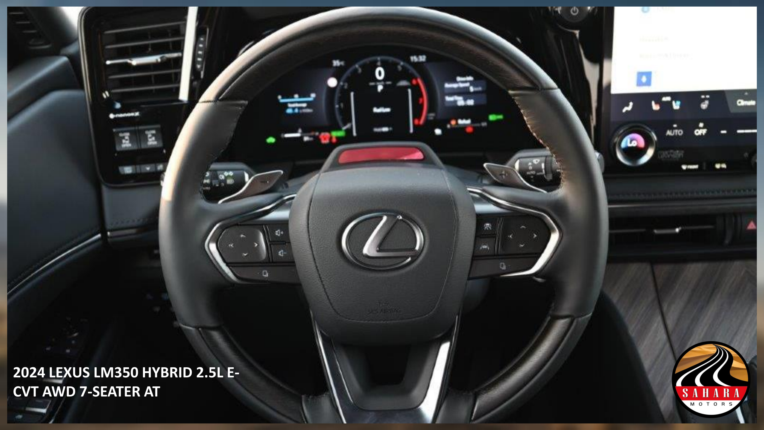
2024 LEXUS LM350 HYBRID 2.5L E-CVT AWD 7-SEATER AT