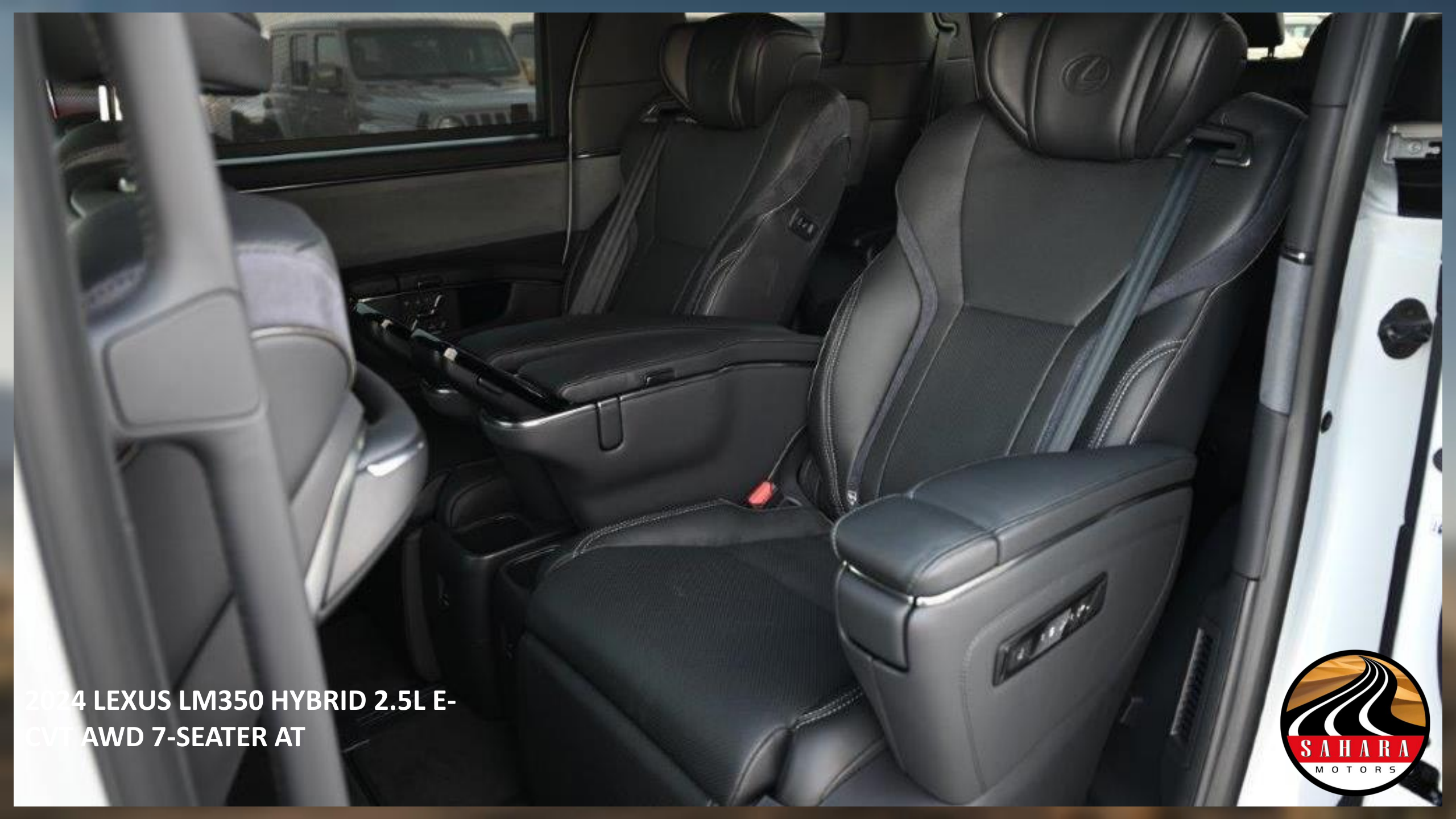
2024 LEXUS LM350 HYBRID 2.5L E-CVT AWD 7-SEATER AT