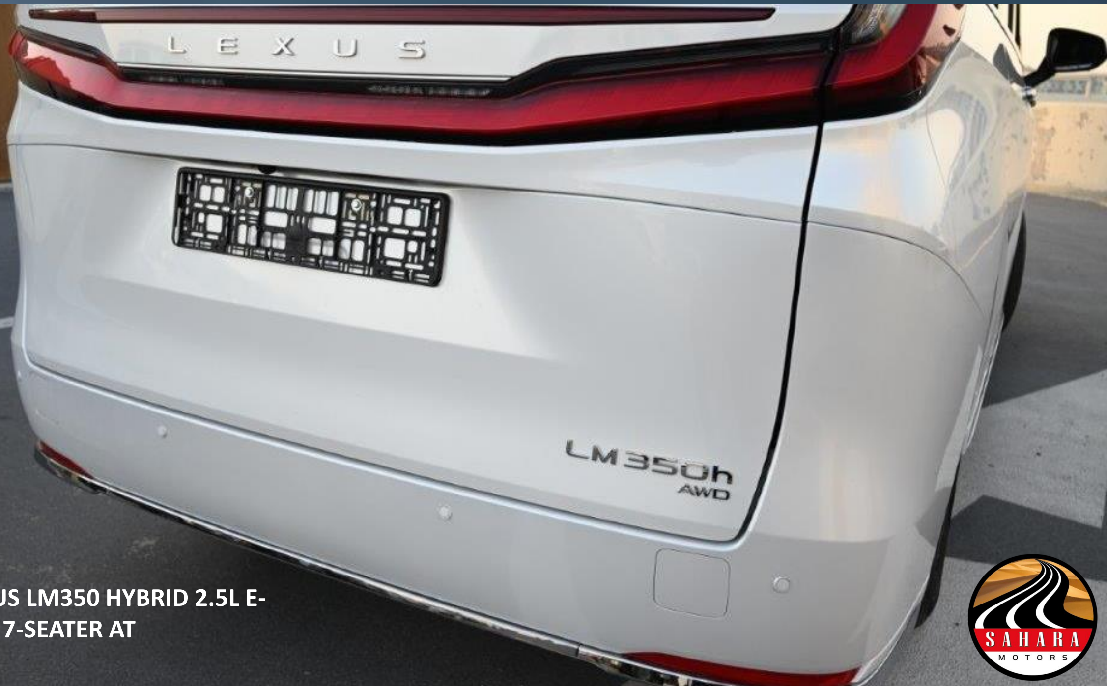
2024 LEXUS LM350 HYBRID 2.5L E-CVT AWD 7-SEATER AT