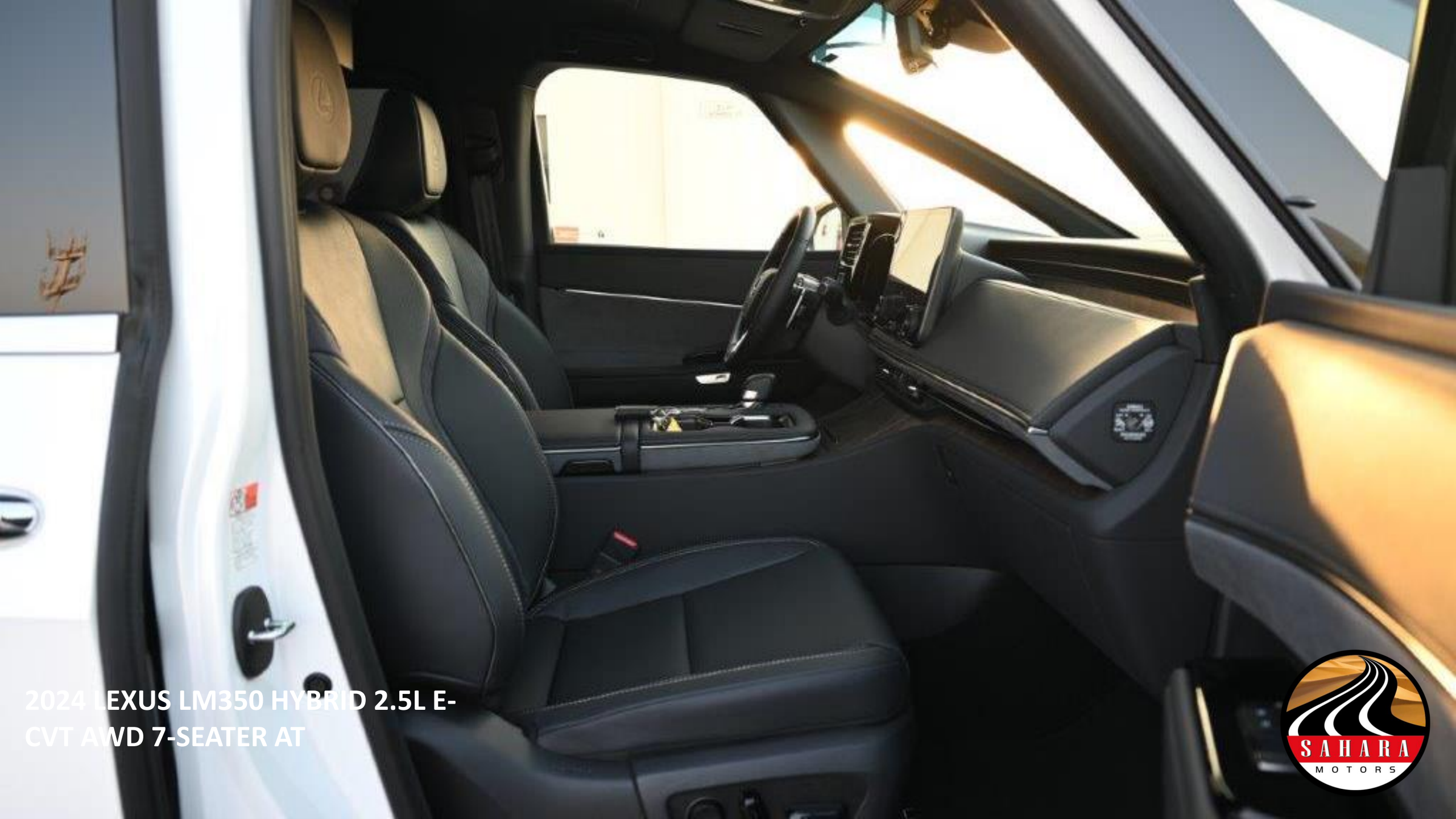
2024 LEXUS LM350 HYBRID 2.5L E-CVT AWD 7-SEATER AT