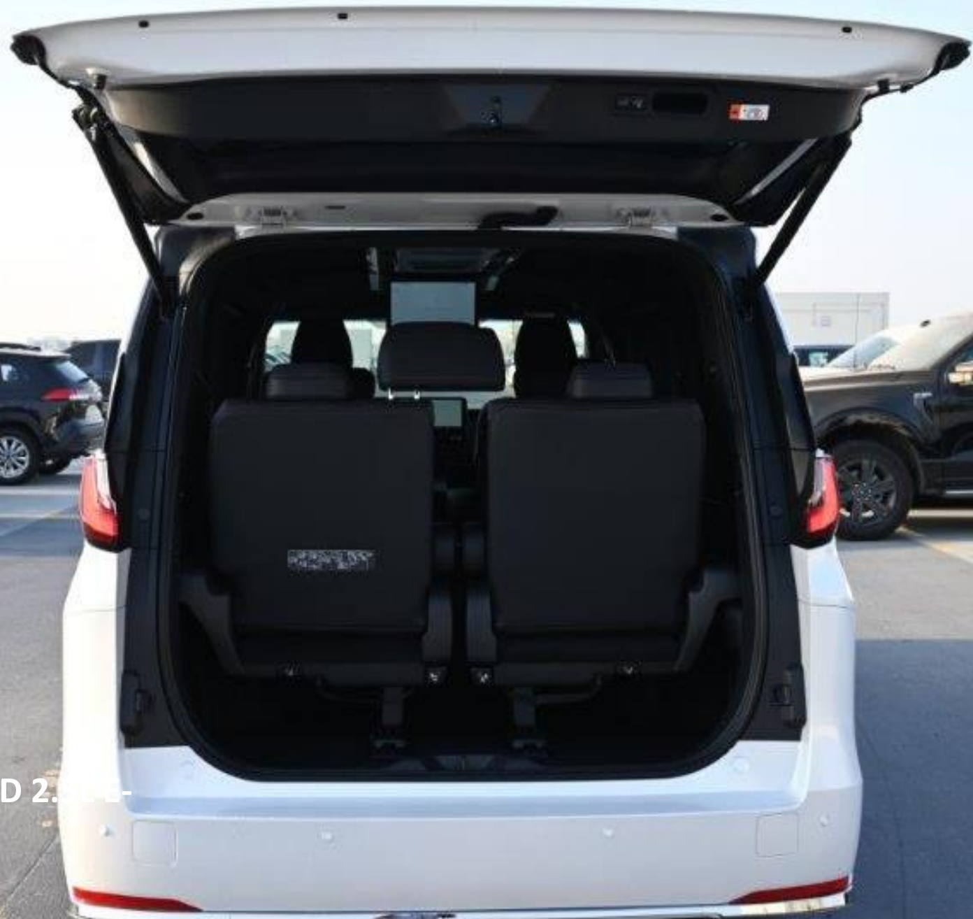
2024 LEXUS LM350 HYBRID 2.5L I4 CVT AWD 7-SEATER AT