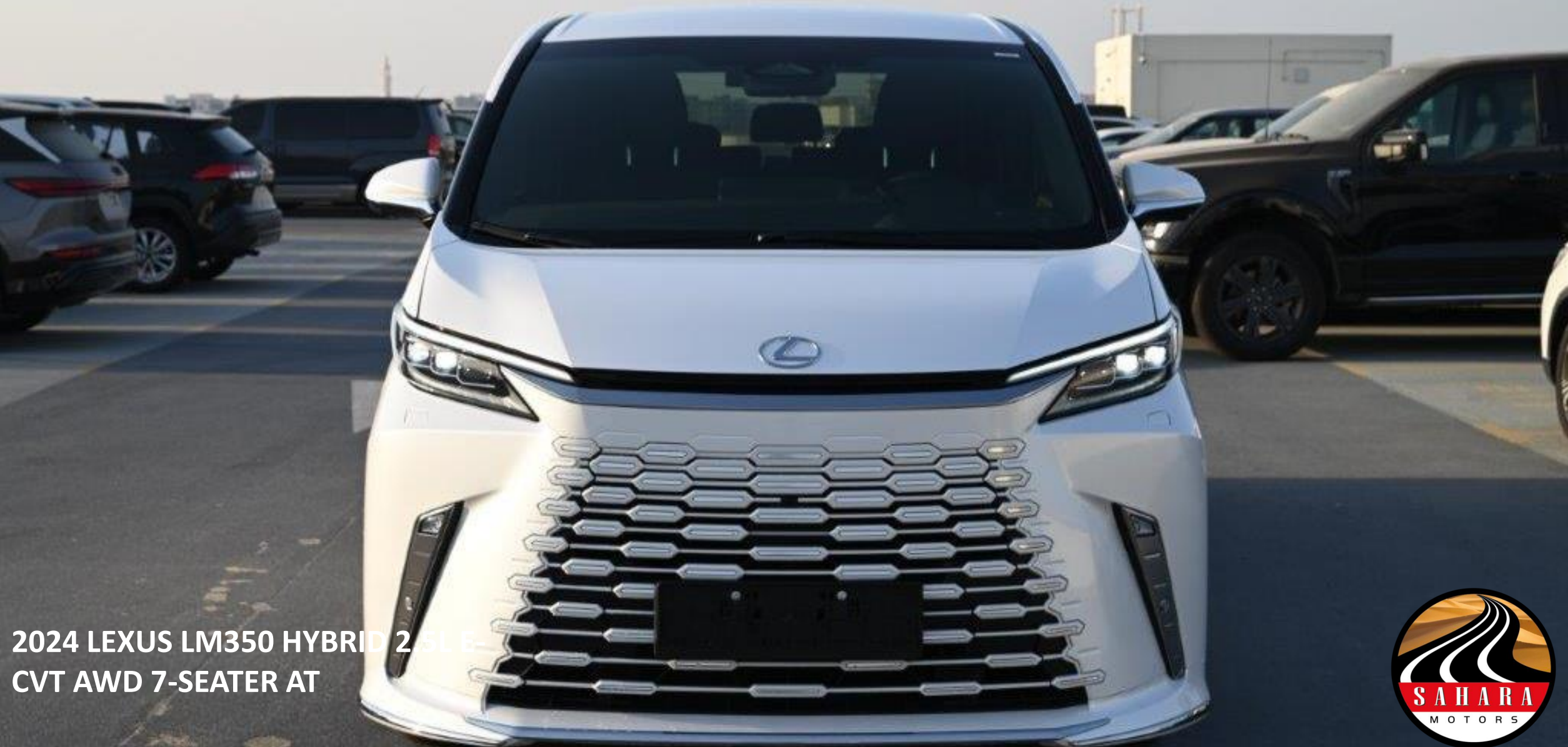
2024 LEXUS LM350 HYBRID 2.5L E- CVT AWD 7-SEATER AT