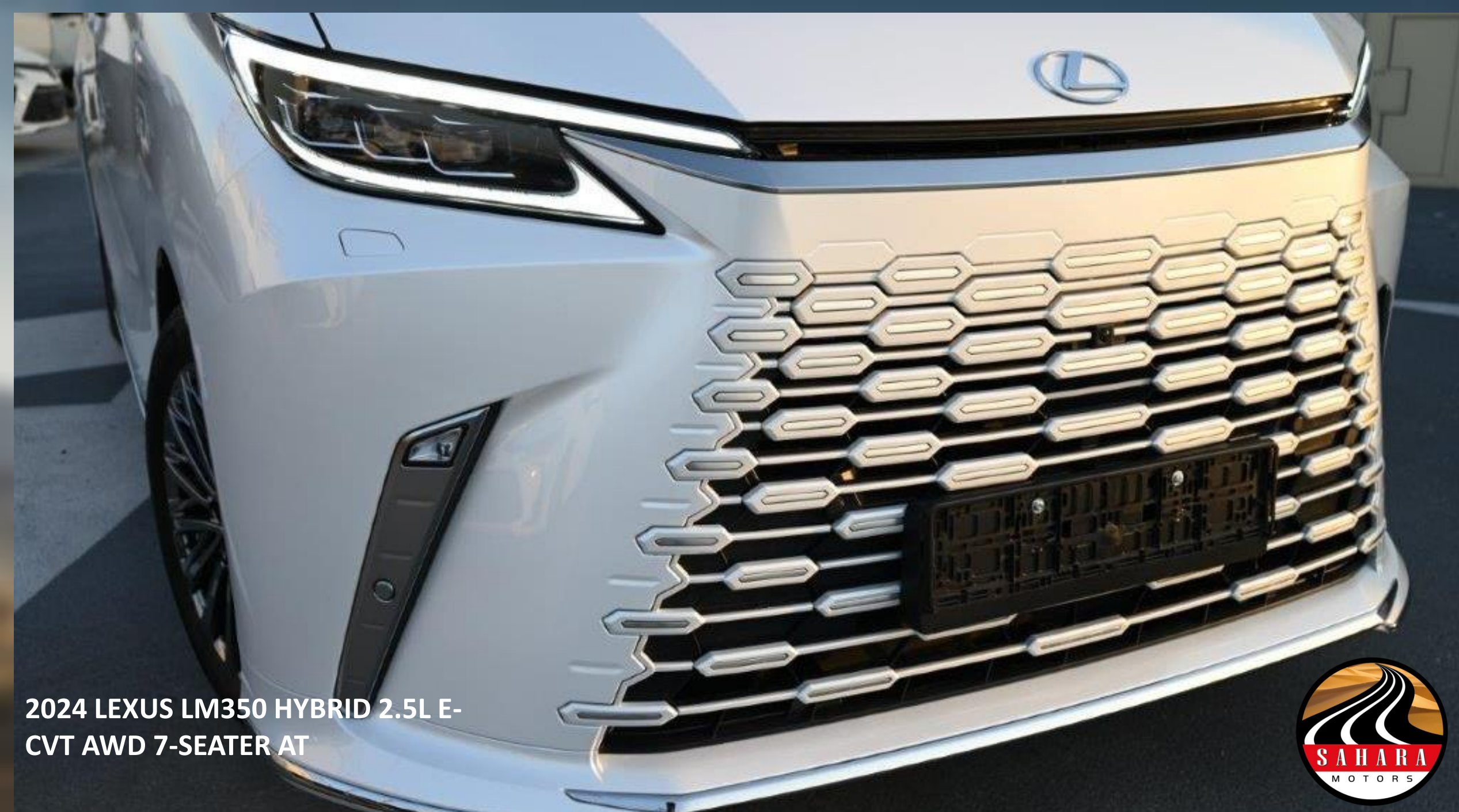
2024 LEXUS LM350 HYBRID 2.5L E-CVT AWD 7-SEATER AT