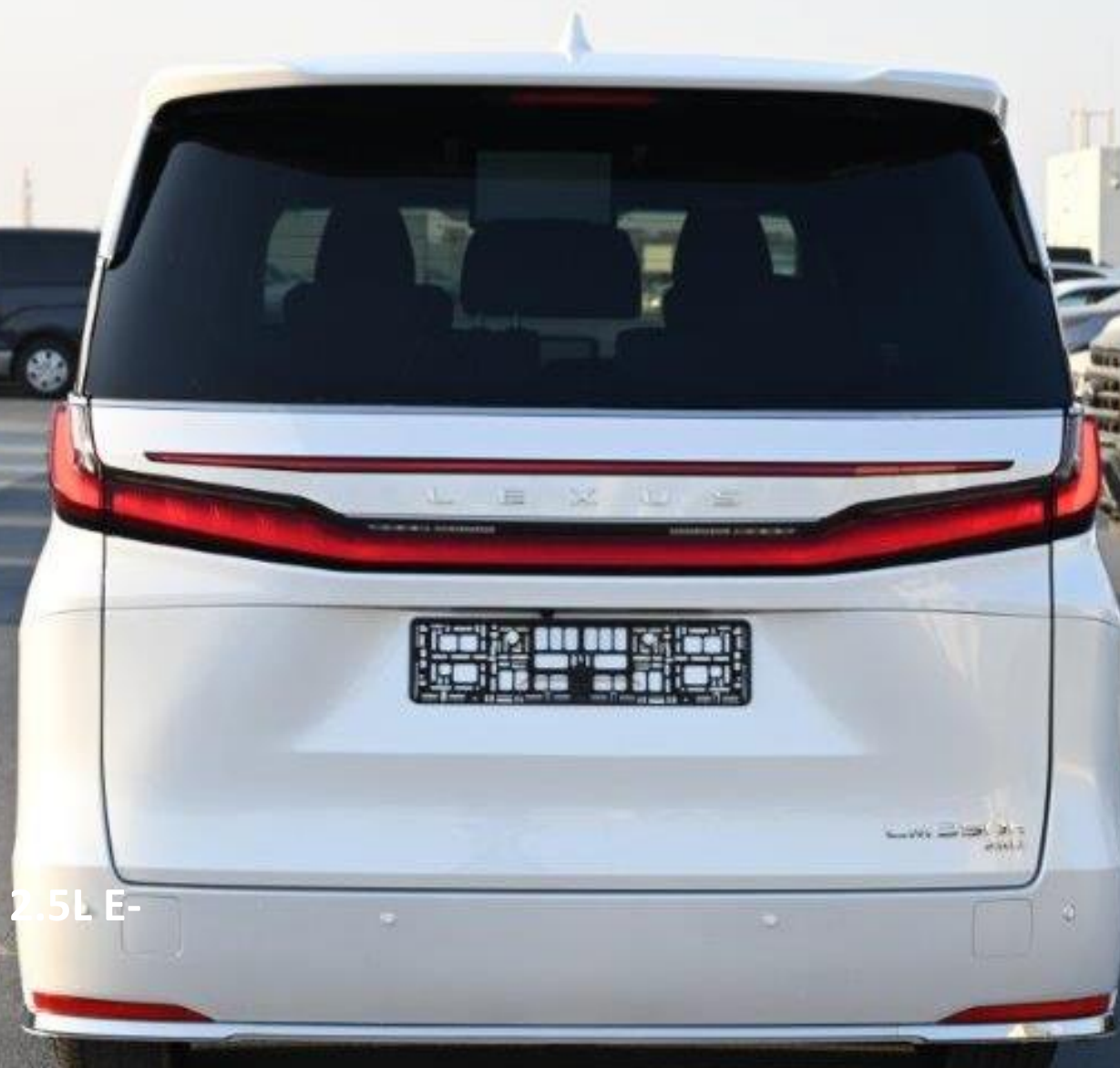
2024 LEXUS LM350 HYBRID 2.5L E-CVT AWD 7-SEATER AT