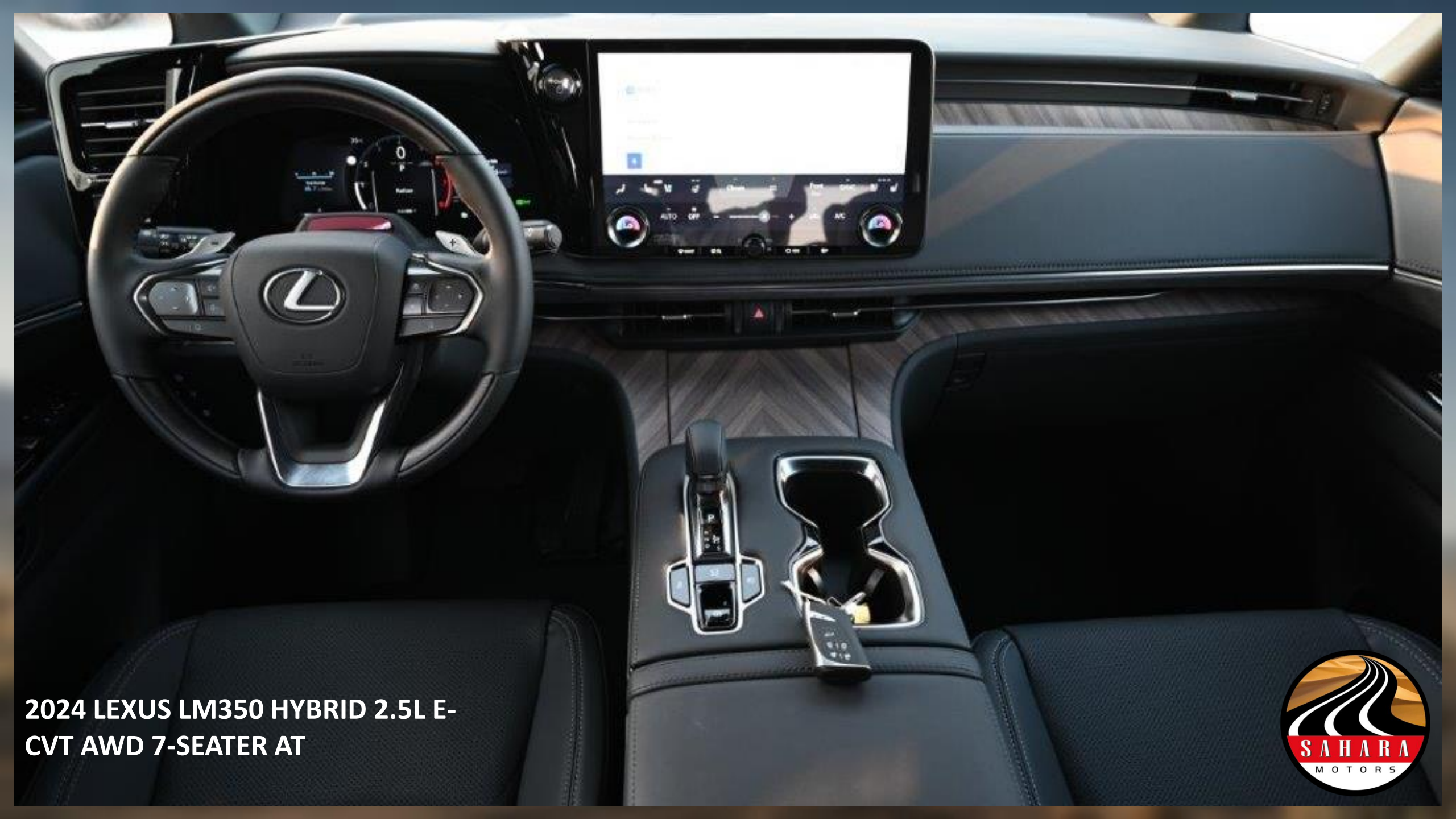
2024 LEXUS LM350 HYBRID 2.5L E- CVT AWD 7-SEATER AT