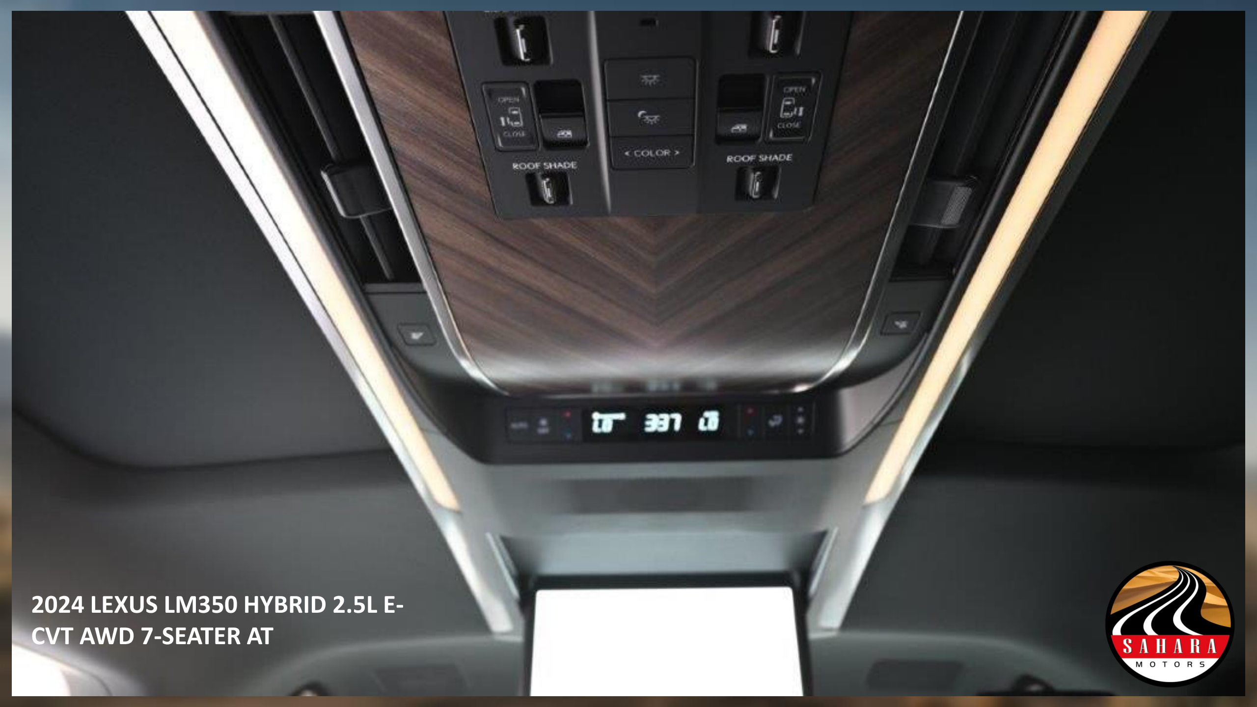
2024 LEXUS LM350 HYBRID 2.5L E-CVT AWD 7-SEATER AT